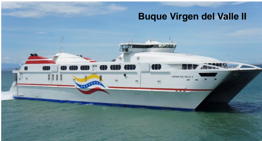
Buque Virgen del Valle II